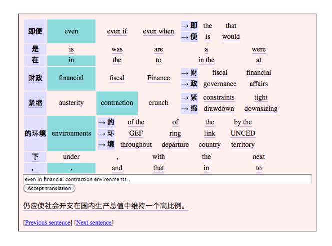
Figure 2. The interface for displaying translation options, with two null selections (rows 2 and 7) and one alternative selection (row 5). This set of selections corresponds to a total of three clicks, the minimum number required to produce this set of selections.